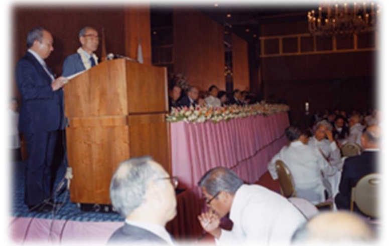
Speech by PM Fukuda in Manila on 18 August 1977